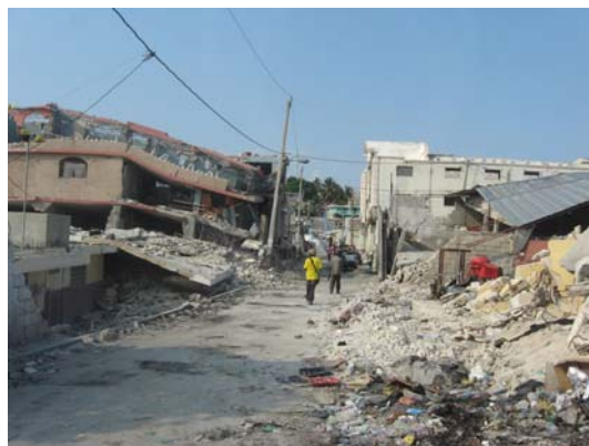
Typical street in Carrefour, Haiti outside the capital, Port-au-Prince. March 11, 2010